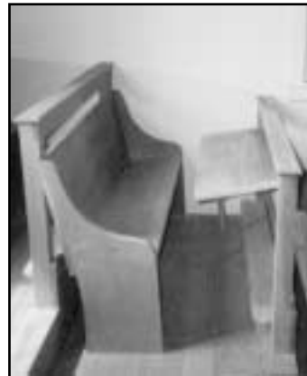
One of the benches in the North Dartmouth Meeting House before disassembly.