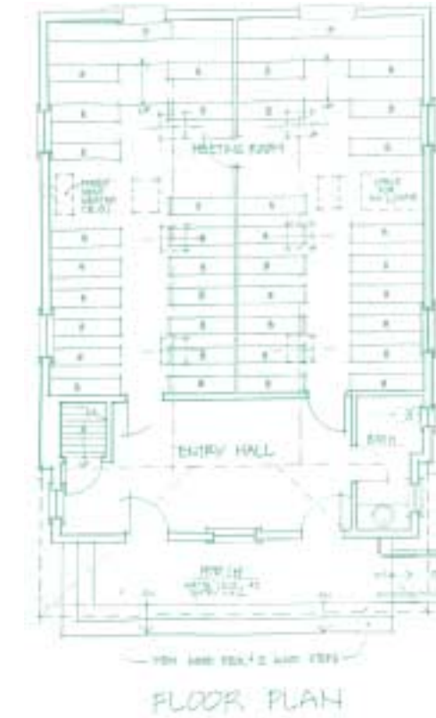
Architect's drawing of the plan for the interior of the North Dartmouth Meeting House.

Other capital needs have been identified as well, including making the buildings easier and less expensive to maintain, and more energy-efficient. Solar electric panels have already been installed as a demonstration project, and now supply more electricity than is required to power the administrative offices. Combined with solar hot water and energy-efficient lighting, these improvements have sharply reduced Woolman Hill's need for power from the energy grid, easing the impact of our activities on the land. And as Woolman Hill becomes an ever-smaller consumer of resources, we can focus on our programs — the center of Woolman Hill.