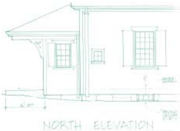
Architect's drawing of North Dartmouth Meeting House at its new location.