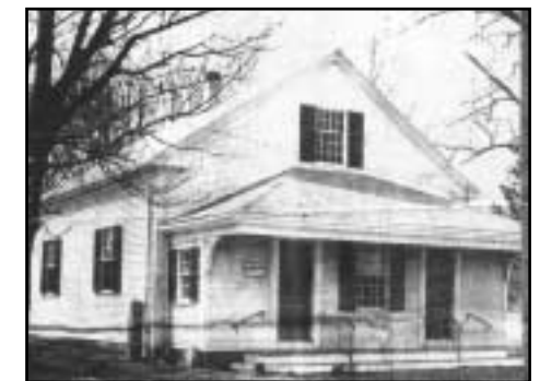
The North Dartmouth Meeting House in its original location.