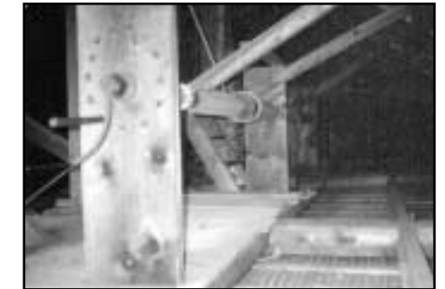
The North Dartmouth Meeting House's overhead pulley system to raise and lower the panels dividing the men's monthly meeting from the women's.